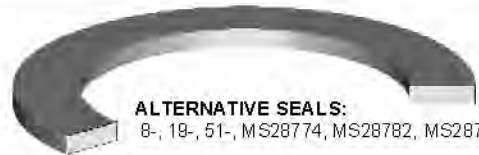
ALTERNATIVE SEALS: 8-, 18-, 51-, MS28774, MS28782, MS28783